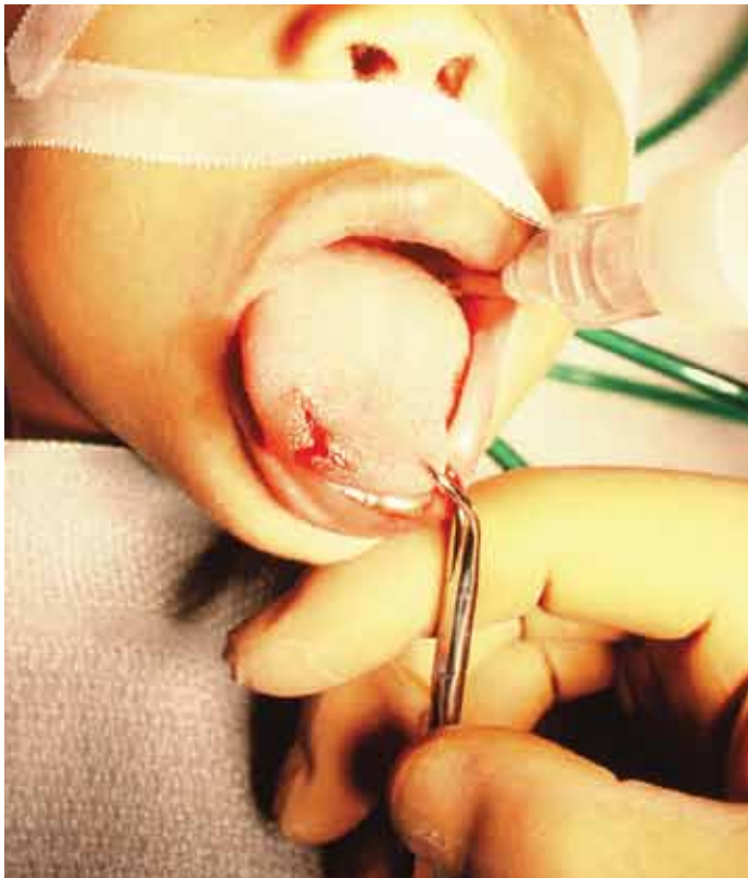
This child's laceration to the edge of the tongue was repaired in the OR. Grasping the tongue with a towel clip aided the repair.

and physician. The repair of a child's laceration in the emergency room will generally require moderate to deep sedation with an agent such as ketamine.