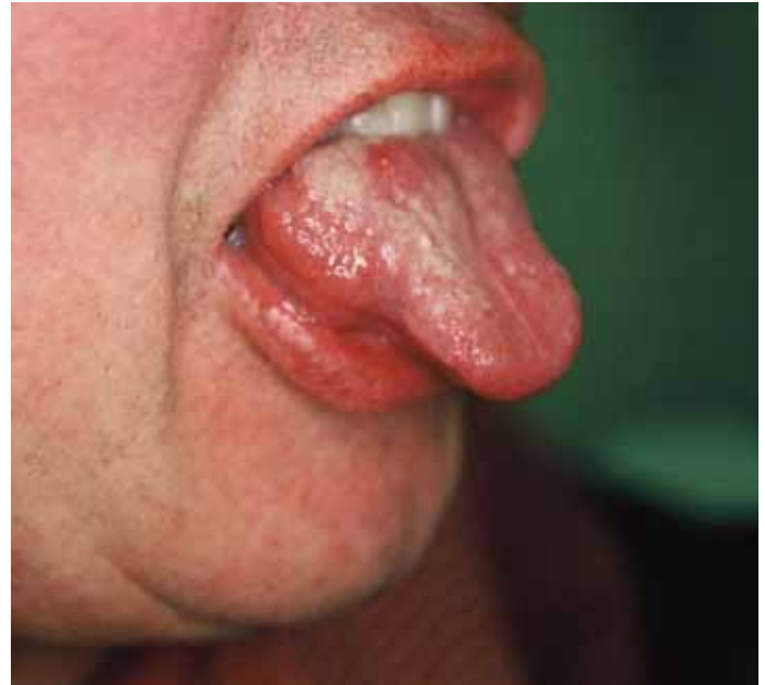
This diabetic patient's tongue developed an abscess, which could be incised and drained in the emergency department.

(1) close the wound; (2) minimize the risk of complications; (3) preserve mobility and the ability to position the tongue; (4) preserve speech articulation; (5) preserve the ability to swallow (deglutition); (6) preserve taste; and, in some cases, to (7) address cosmetic concerns (e.g., bisected or cleft tongue) or sexual concerns (e.g., STDs). Usually, sutured lacerations heal faster and have a lower risk of infection. Fortunately, tongues usually do not become infected.