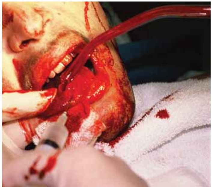
This large tongue laceration bled profusely. Hemostasis and wound closure was achieved with interrupted 4-0 Vicryl sutures.

Tongue lacerations typically bleed heavily because of the rich supply of blood in that area.