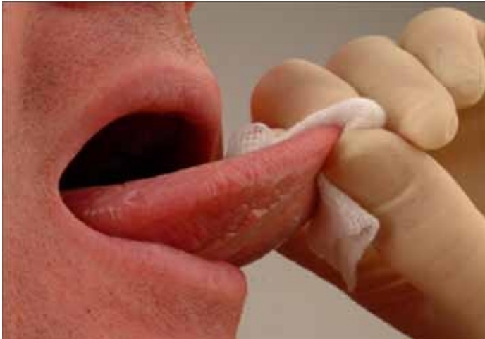
While treating lacerations and tongue injuries, physicians may detect the presence of oral cancer or a pre-cancerous condition (e.g., lesions, white or red patch, difficulty moving the tongue, lumps, or any enlarged or thickened areas). Early detection and treatment of this disease is the key to survival. If suspicion of oral cancer arises during a tongue-related emergency, a biopsy is recommended.

firmly forward, manipulate its position until the top and underside of the tongue can be fully examined, as well as the base of the tongue where it begins to turn down the throat. When observed directly from the front, the tongue and openings to the back of the mouth should appear symmetrical and not be swollen. Gaping of lacerations and the source of any bleeding during manipulations should be carefully observed.