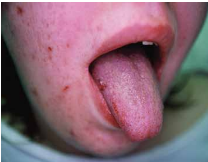
Careful inspection of the right side of the tongue helped confirm a seizure in this patient.

Lacerations of the tongue are often the result of a fall, seizure, bite to the tongue, or impact. A bite to the tongue can help distinguish a seizure from other spells. A lateral bite to the tongue was 100% specific for a tonic-clonic seizure according to Benbadis et al. Only 1 in 45 patients with syncope suffered a tongue laceration, and that laceration was at the tip of the tongue. Pseudoseizures rarely result in glossal injury. One autopsy study found that a tongue bite helped to distinguish death from a seizure from cardiac death.