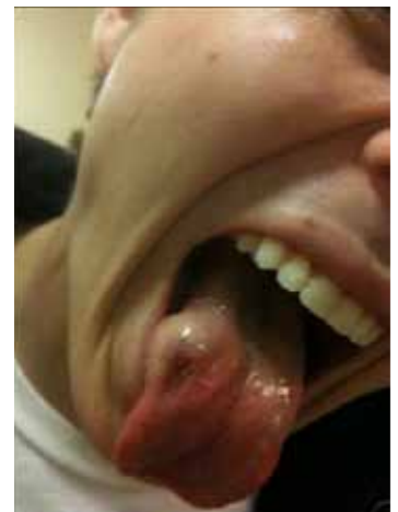
MTV's The Hills star, Spencer Pratt, received stitches for 2010 accidental tongue injury.